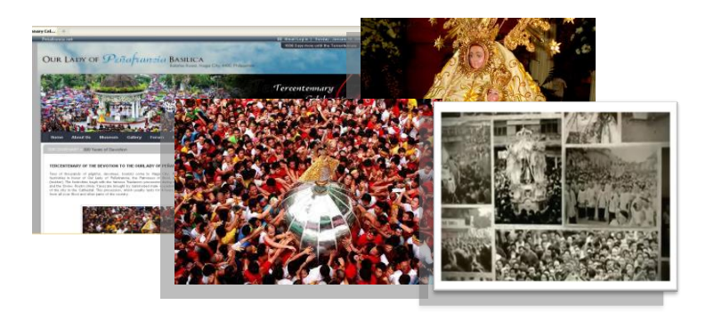
Figure 1. The Historic 300 Years Celebration of Our Lady of Peňafrancia Devotion by Filipinos