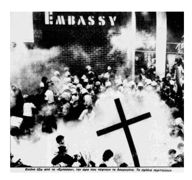
Image 2 Violent clashes outside the "Embassy" movie theatre playing the film The Last Temptation of Christ , 1988