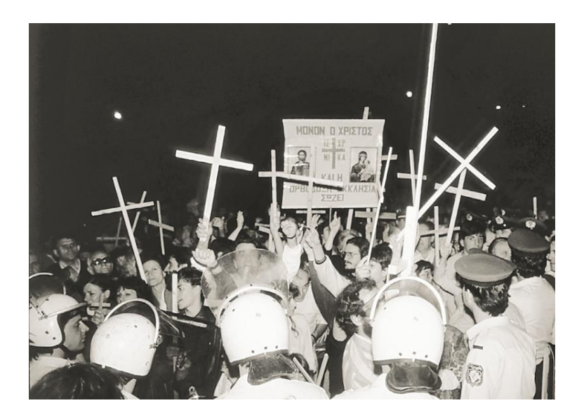
Image 1 Demonstrators protesting projection of the film The Last Temptation of Christ, 1988