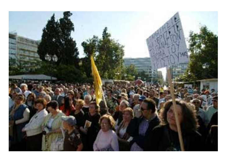
Image 5 Protesters gather outside the Athens Single-member Court of First Instance to demonstrate against projection of the film The Da Vinci Code