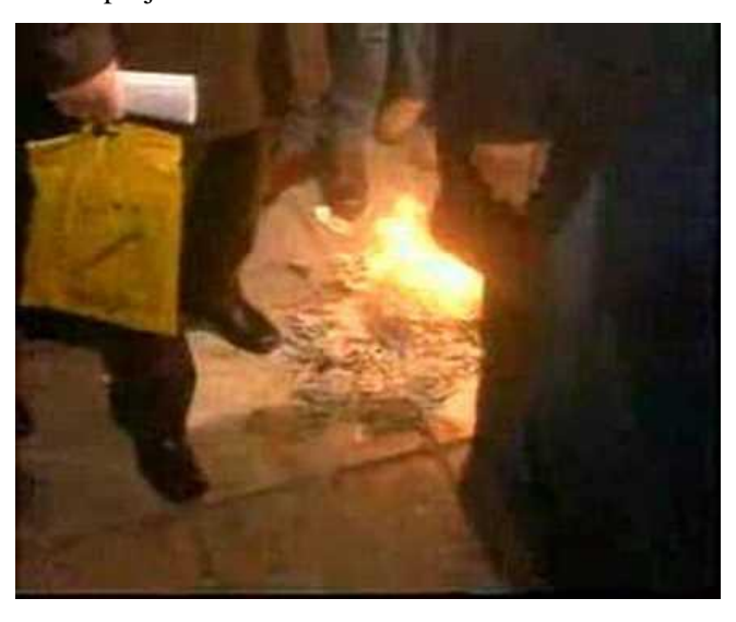
Image 6 Organised burning of copies of Mn in Thessaloniki outside the bookstore where the book was presented, 2000