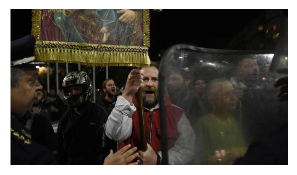
Image 4 Protesters demonstrate outside the "Acropol" theatre, 2018