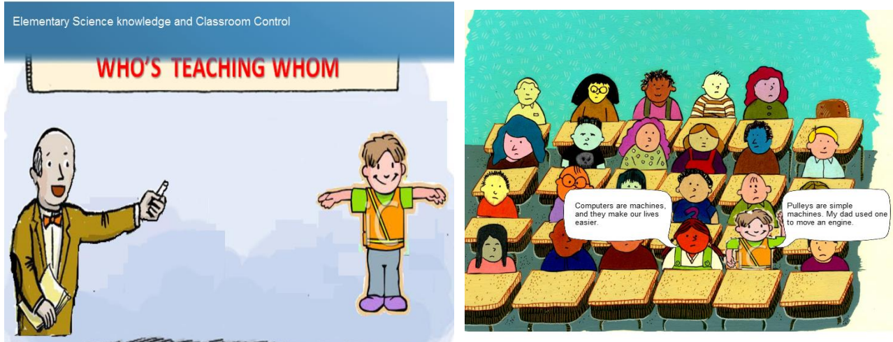
Figure 4: Classroom sequence