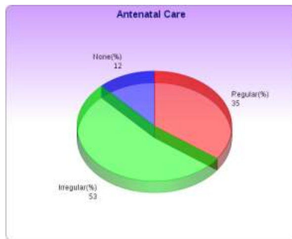
Fig 3: Distribution of the study population by antenatal checkup

Figure 3 shows that 35 (35%) were on regular antenatal care, 53 (53%) had irregular and 12 (12%) had no ANC. Table IV shows that out of 100 women, 35 (35%) were primigravida, 31(31%) were 2 nd gravid and the rest 34 (34%) were 3 rd or more.