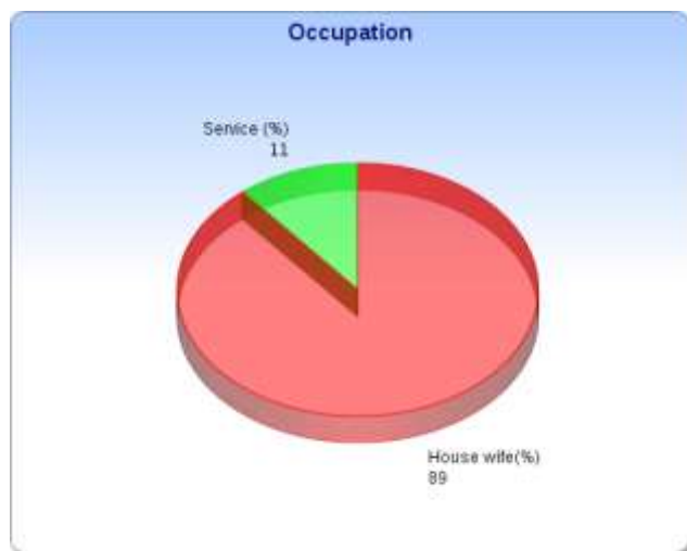
Fig 1: Distribution of occupation of the respondents.

Figure I show that 89 (89%) women were housewives, 11 (11%) were service holders.