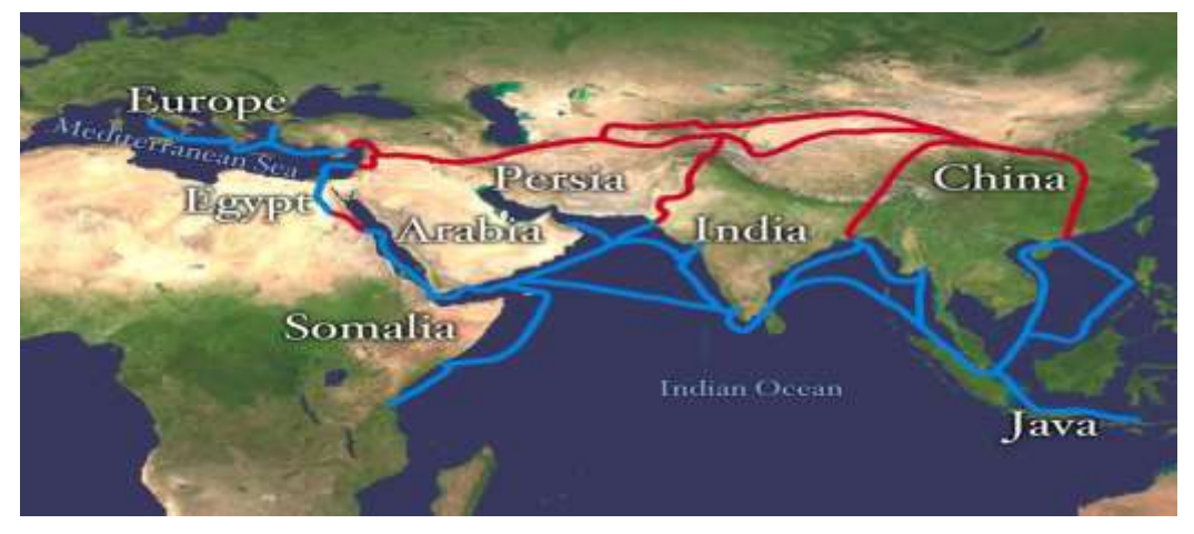
Figure (2) Silk Road Map: Source: Wikipedia Maps: http://en.wikipedia.org/wiki/Silk Road