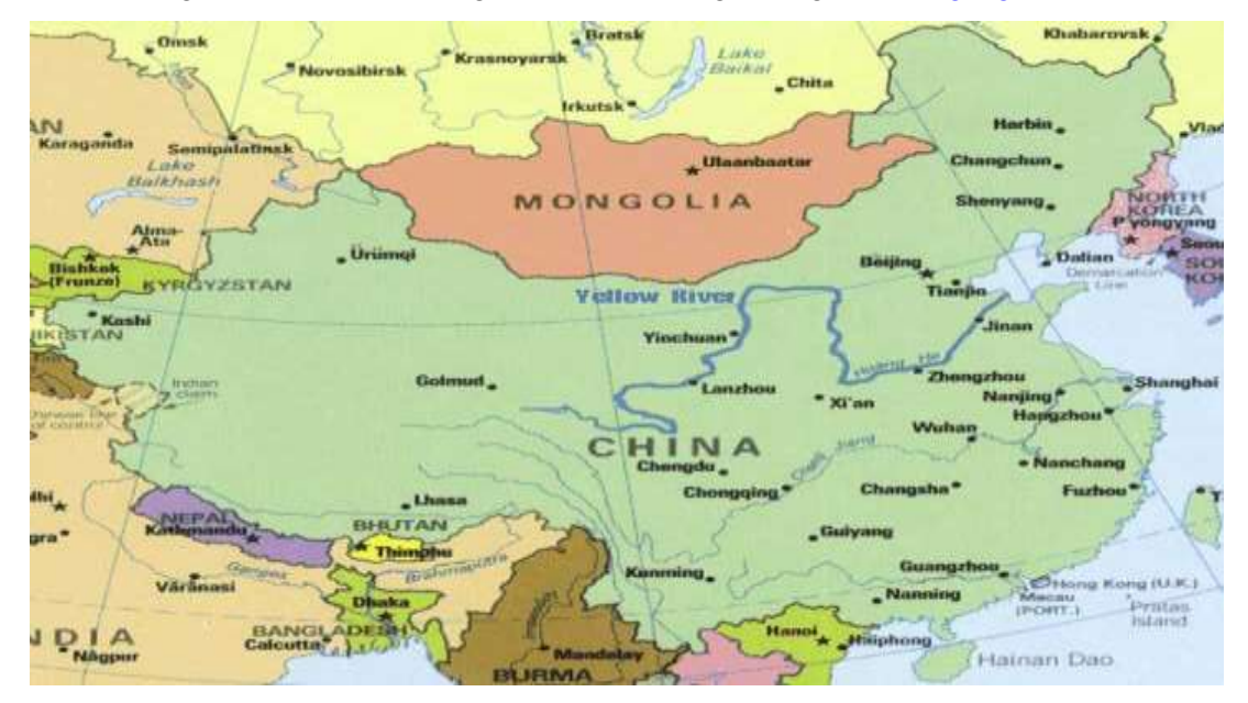
Figure (4) Yellow River.