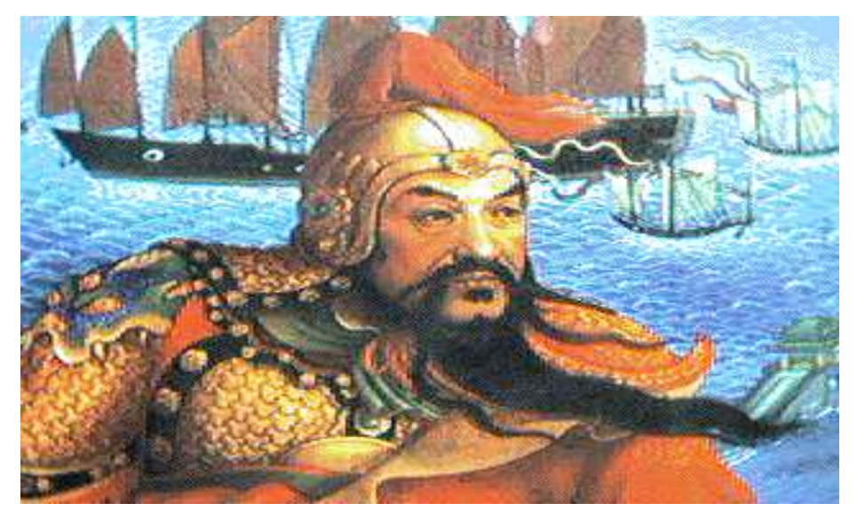
Figure (3) Admiral Zheng He.